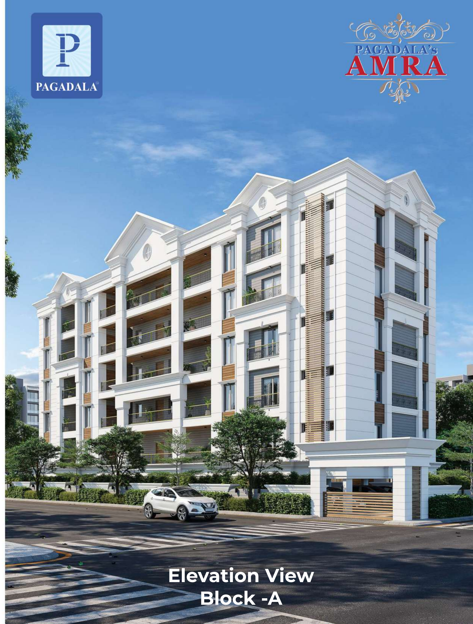
Elevation View Block -A