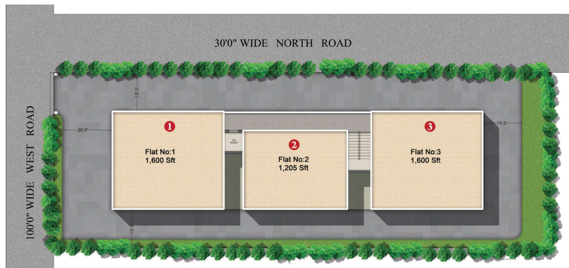
Typical floor plan