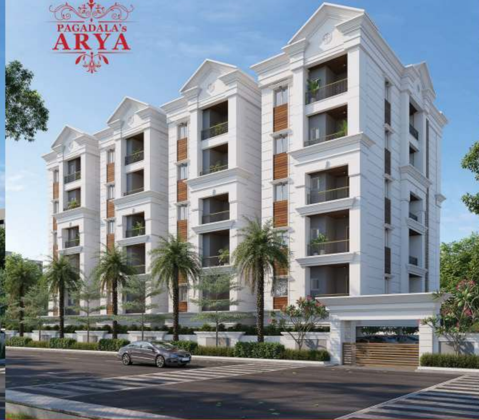
ARYA - Bowrampet, Hyderabad, Telangana