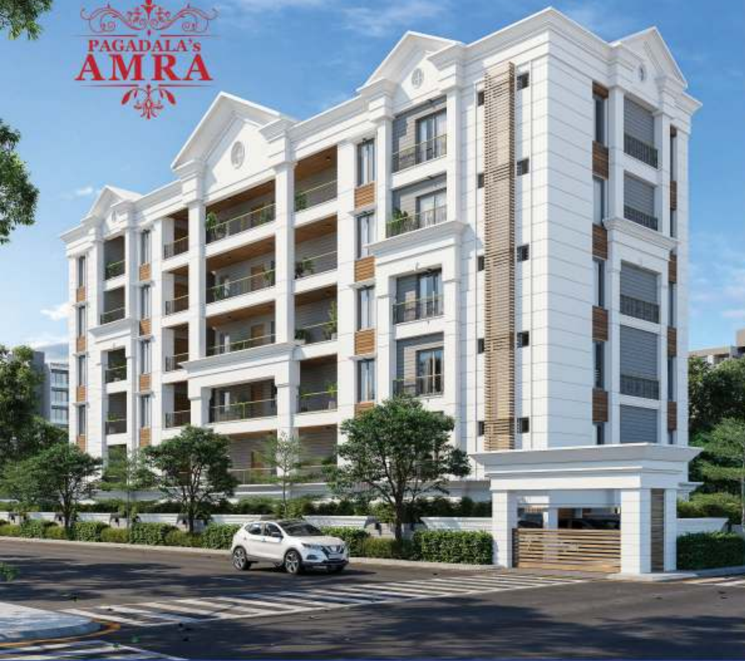
AMRA - Bowrampet, Hyderabad, Telangana