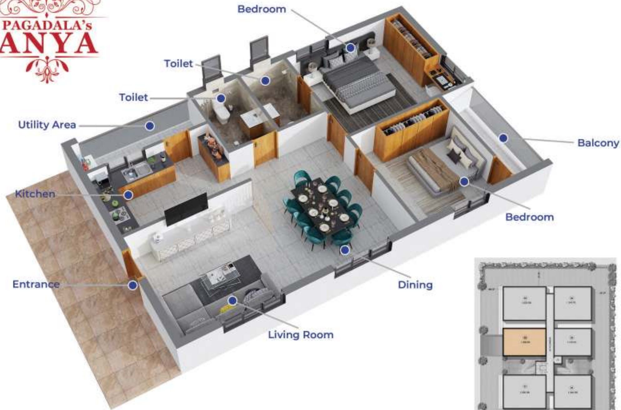
2BHK (1250 SFT) East Face