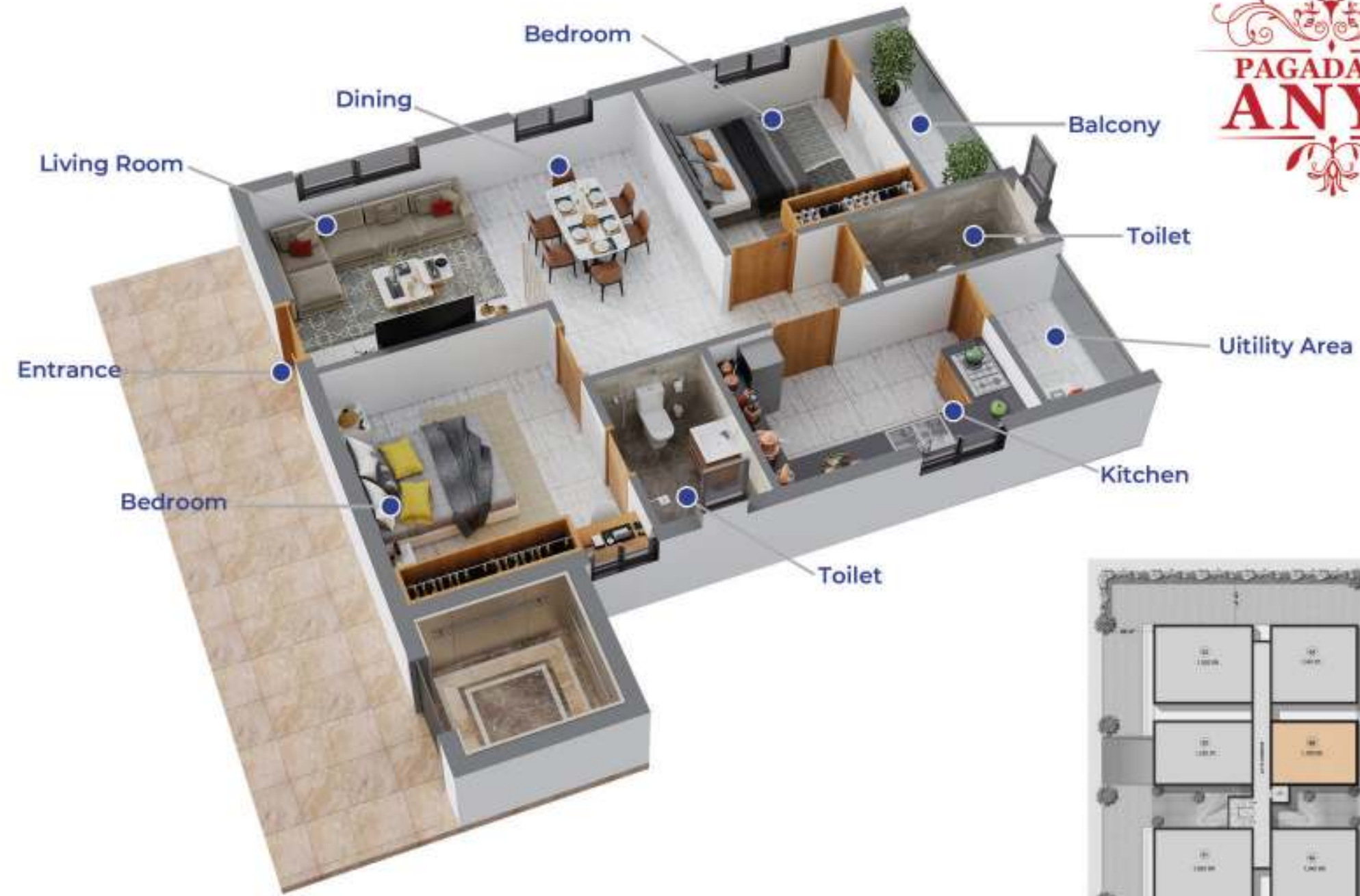
2BHK (1100 SFT) West Face