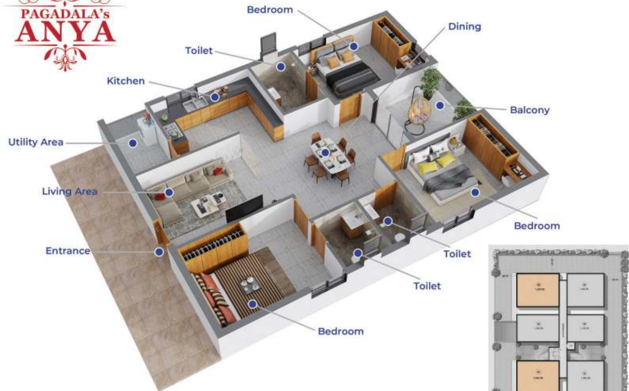
3BHK (1520 SFT) East Face