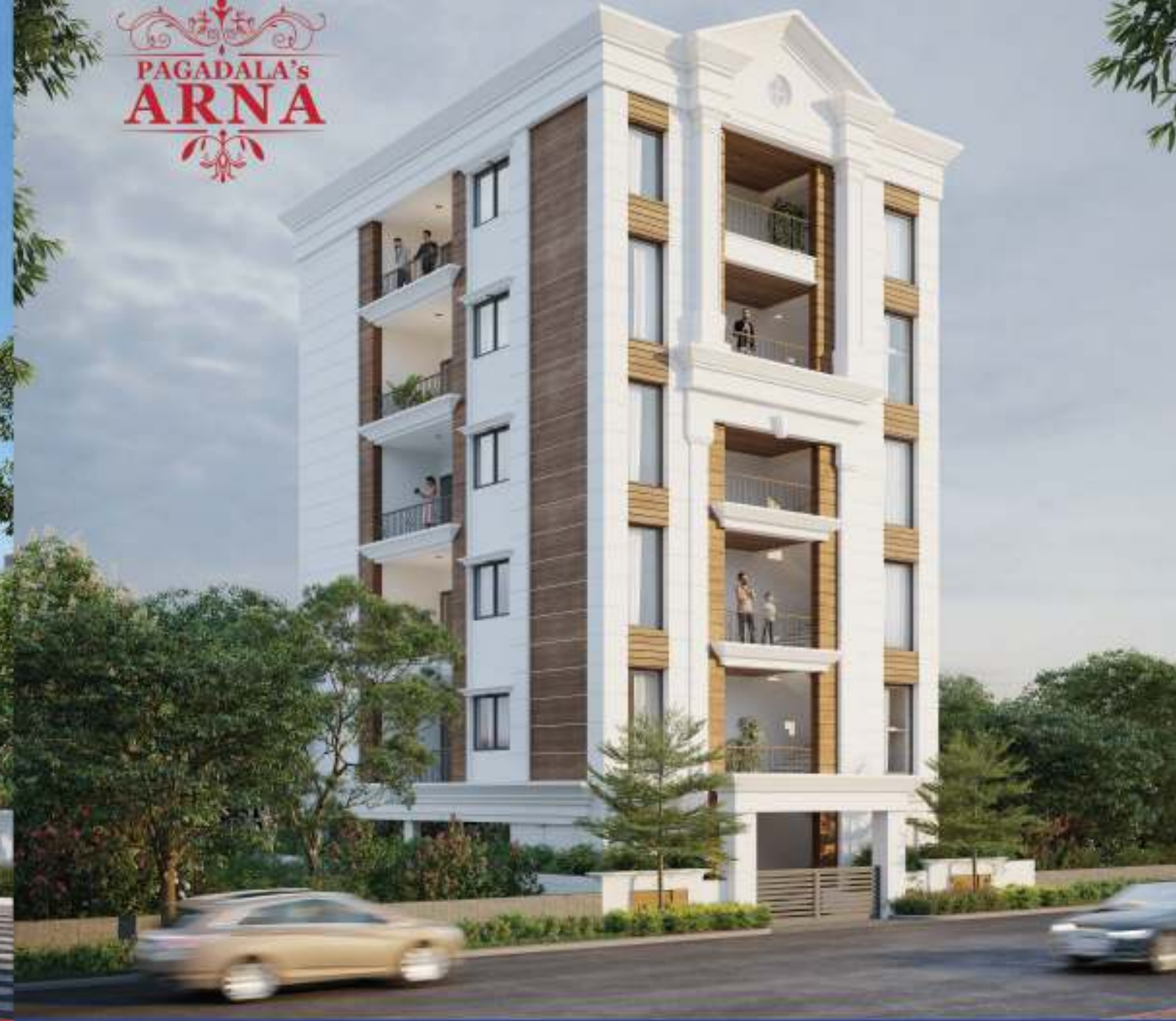
ARNA - Bowrampet, Hyderabad, Telangana