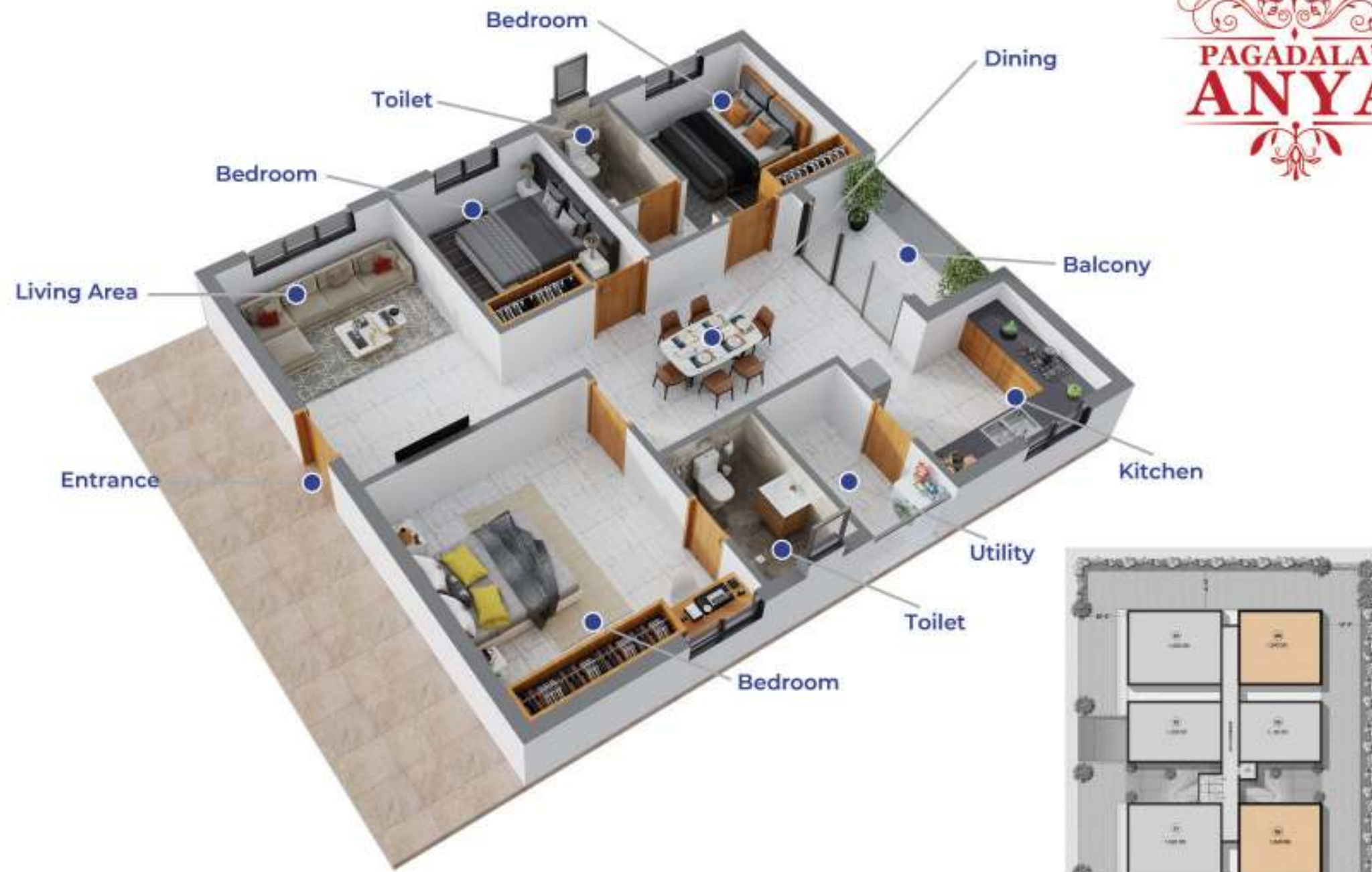
3BHK (1340 SFT) West Face