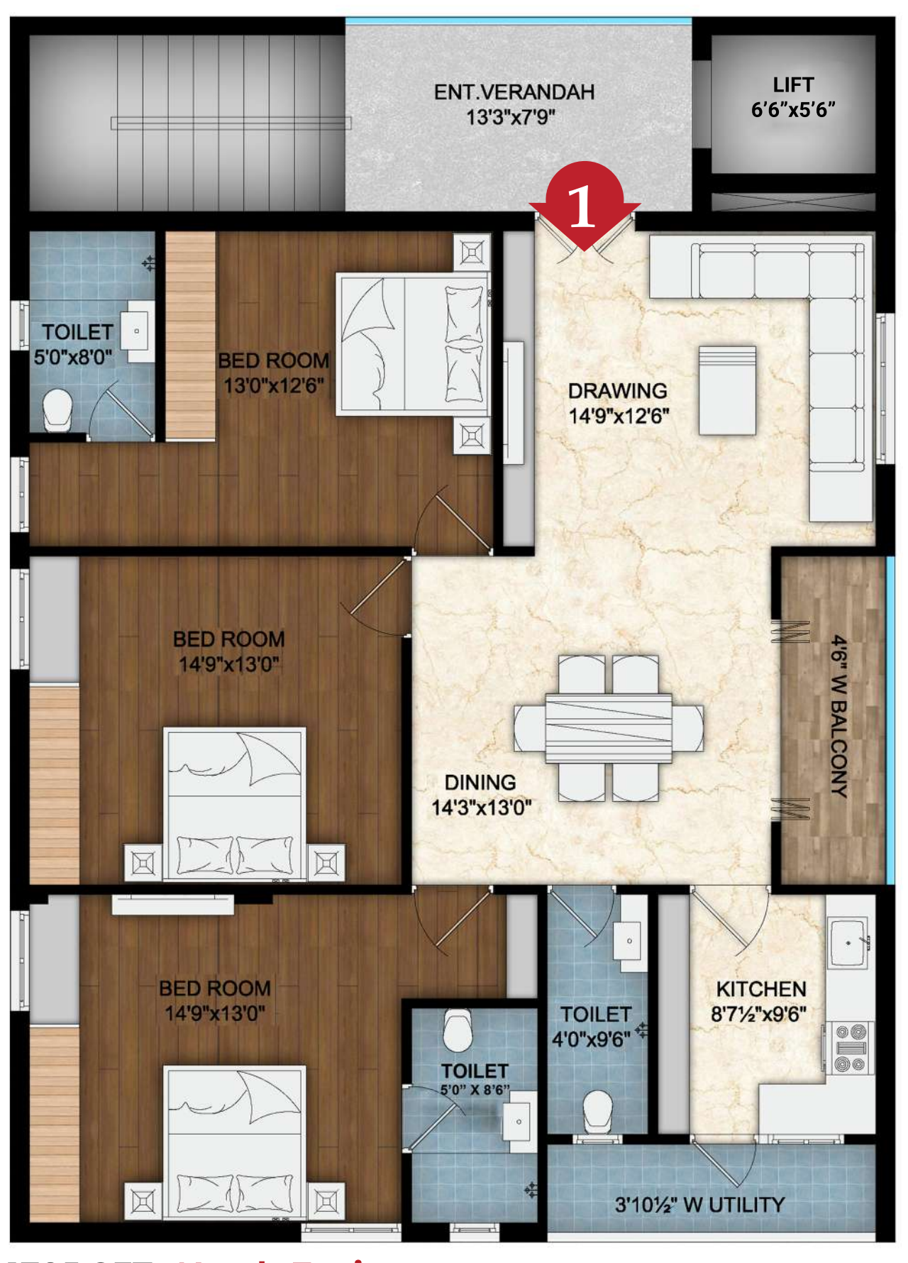
1785 SFT, North Facing