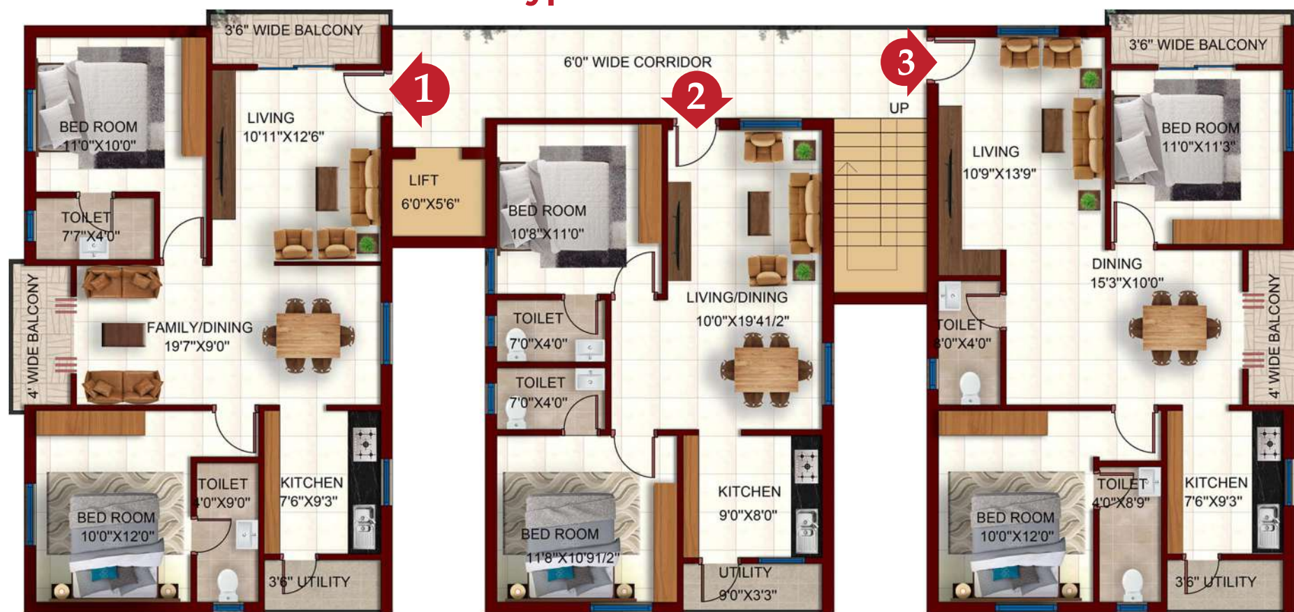
Flat No:1 1175 sft East Facing