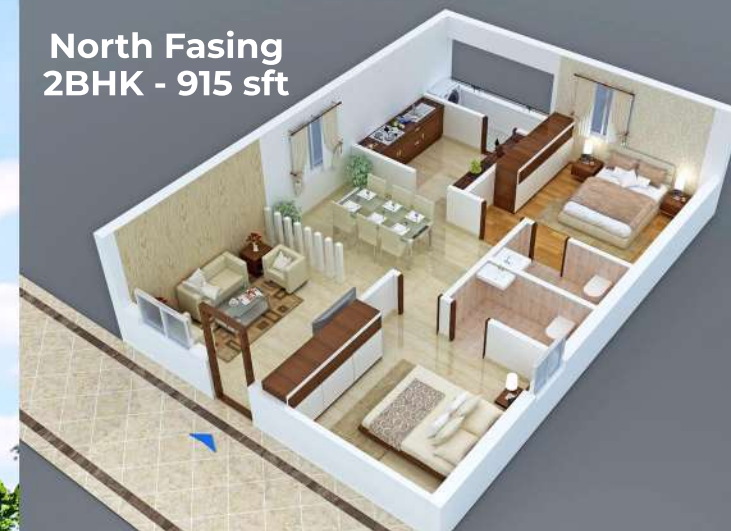
North Facing 2BHK - 915 sft