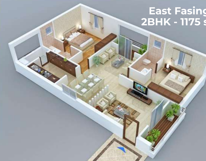
East Facing 2BHK - 1175 sft