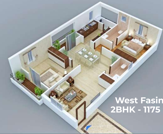
West Facing 2BHK - 1175 sft