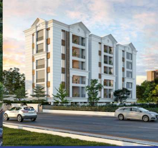
AMRA - Bowrampet, Hyderabad, Telangana