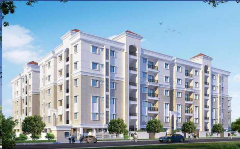
ORION NALLAPADU, West GUNTUR, AP